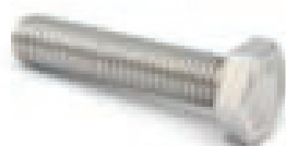
M10 5cm leg Hex Bolts