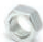
M10 Hex Nut X4