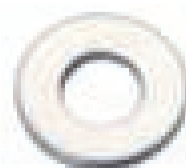
M8 Flat washers X8