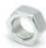
M8 Hex Nut X4